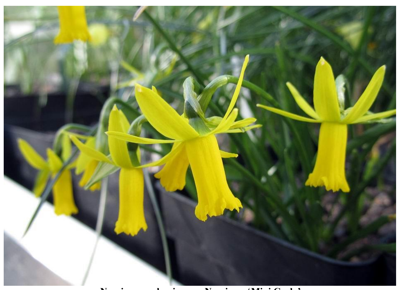
Narcissus cyclamineus x Narcissus 'Mini Cycla'

Another cross that I made using the pollen from Narcissus 'Mini Cycla', shown right, back on to Narcissus cyclamineus, one of its parents. I tried the cross both ways but the only seed I got was on Narcissus cyclamineus.