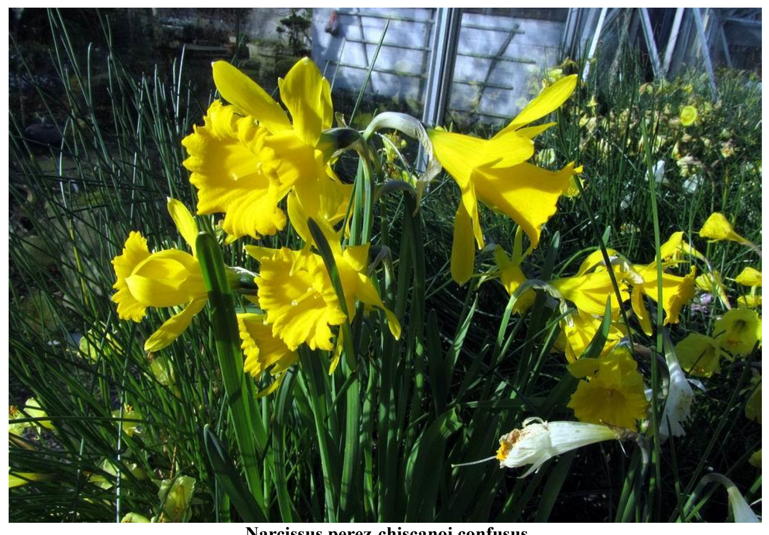
Narcissus perez-chiscanoi confusus

The name that I knew this plant as, Narcissus perez-chiscanoi, has been retired and is replaced by Narcissus confusus.