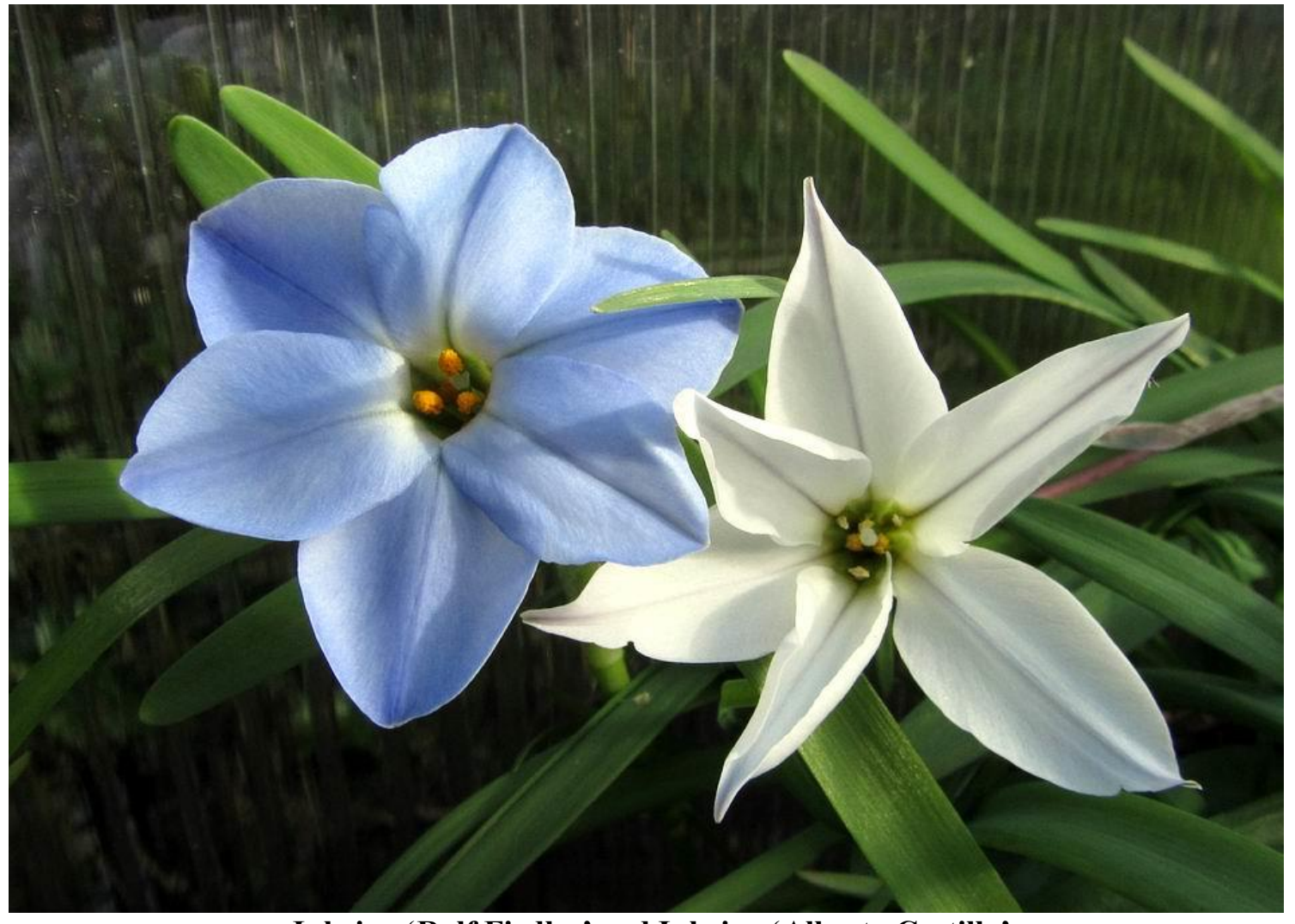
Ipheion 'Rolf Fiedler' and Ipheion 'Alberto Castillo'

Even though we grow both these plants unprotected in the open garden I like to keep some in pots so I can enjoy them under glass – the first flowers are opening outside as well. Another bonus of keeping a selection together