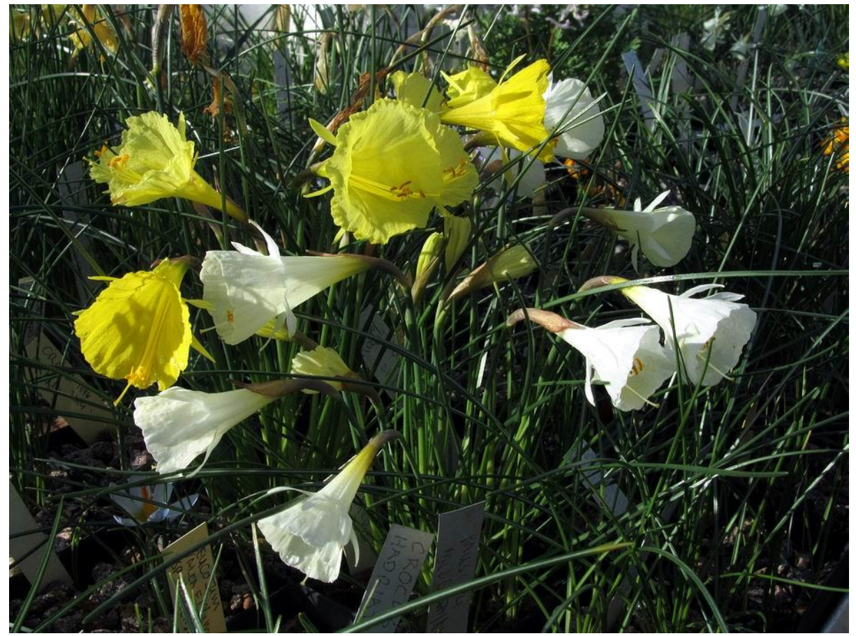
The yellow flowers are a form of Narcissus bulbocodium and the long conical white flowers are a volunteer seedling that I found in the sand plunge and have built up over the last few years.