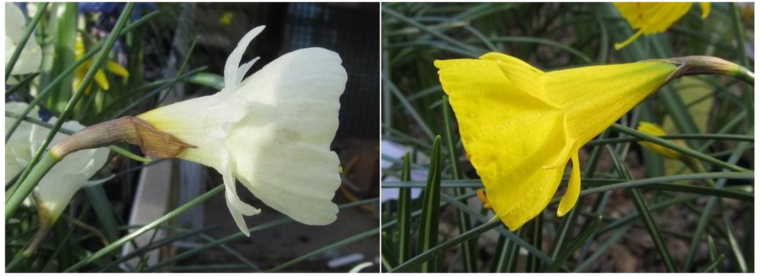
Narcissus 'Don Stead' and other hybrid