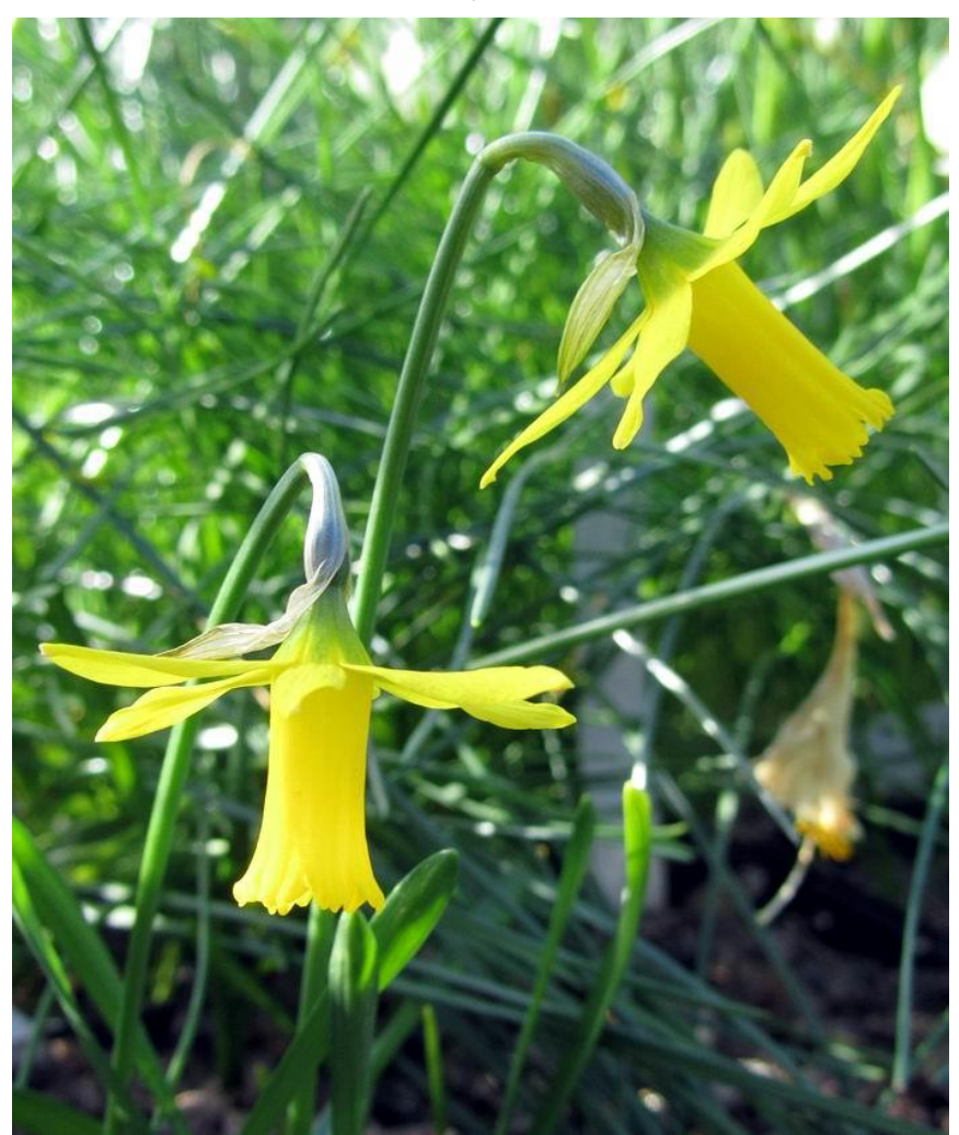
Narcissus 'Mini Cycla'

My hybrid plant, above, is similar in size to N. 'Mini Cycla' but has more reflexed petals showing the increased influence of N. cyclamineus but the biggest advantage is that it seems to be a more vigorous grower.