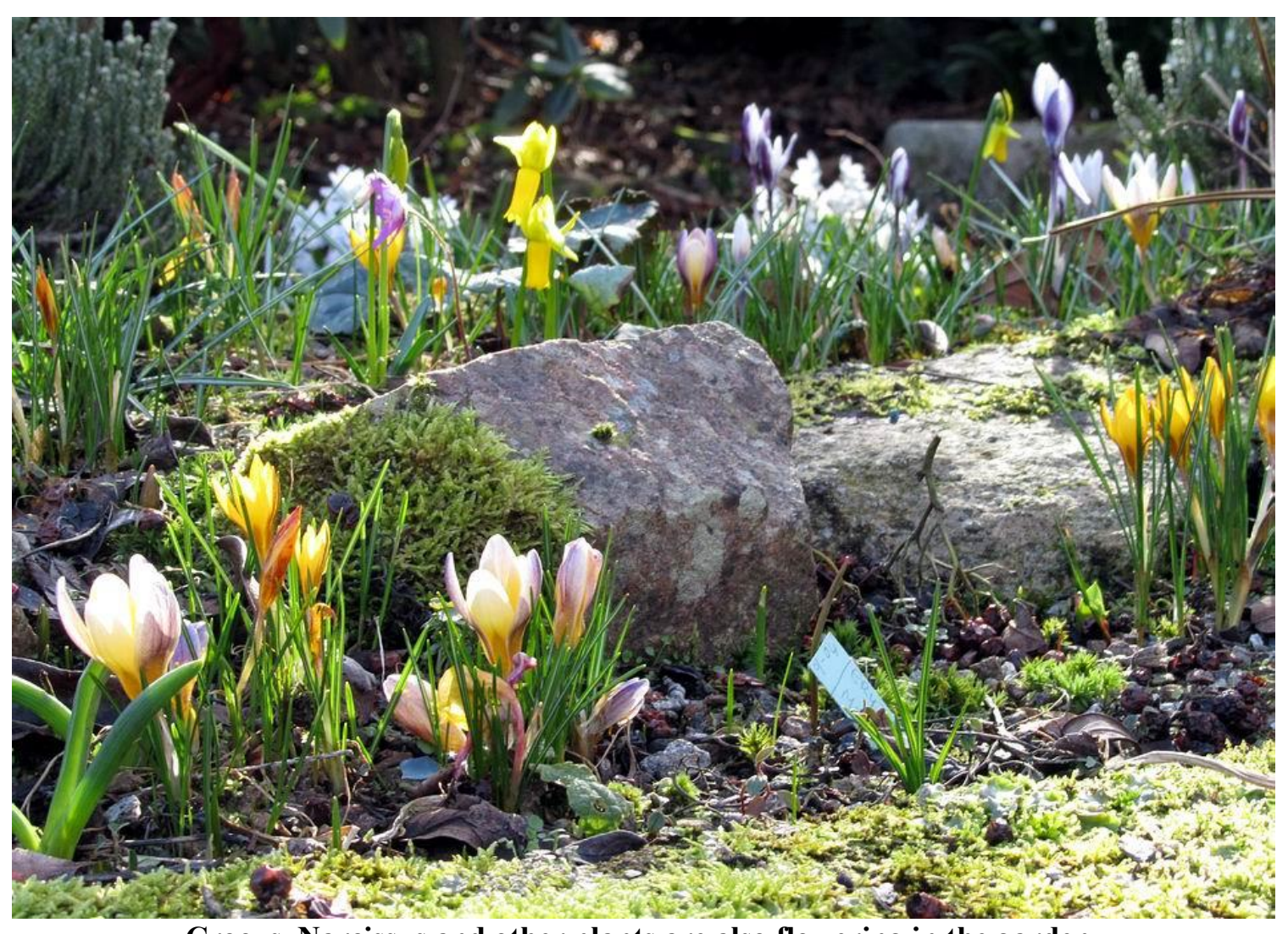
Crocus, Narcissus and other plants are also flowering in the garden.