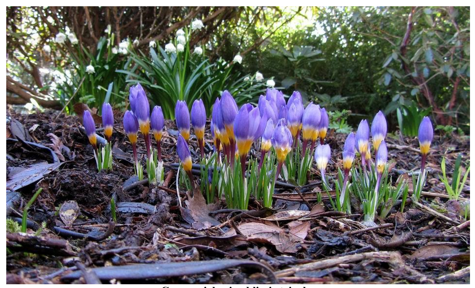
Crocus sieberi sublimis tricolor

Crocus tricolor has to be one of my favourite colour combinations and it is an easy garden plant providing that you can keep the slugs off it.