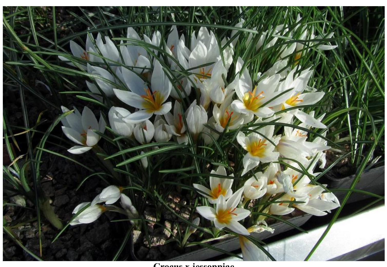
Crocus x jessoppiae