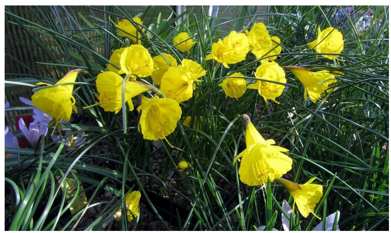
Don Stead deep yellow Narcissus hybrid.

I have no information regarding the parents but I suspect that this may be the same cross involving N. cantabricus and N. bulbocodium.