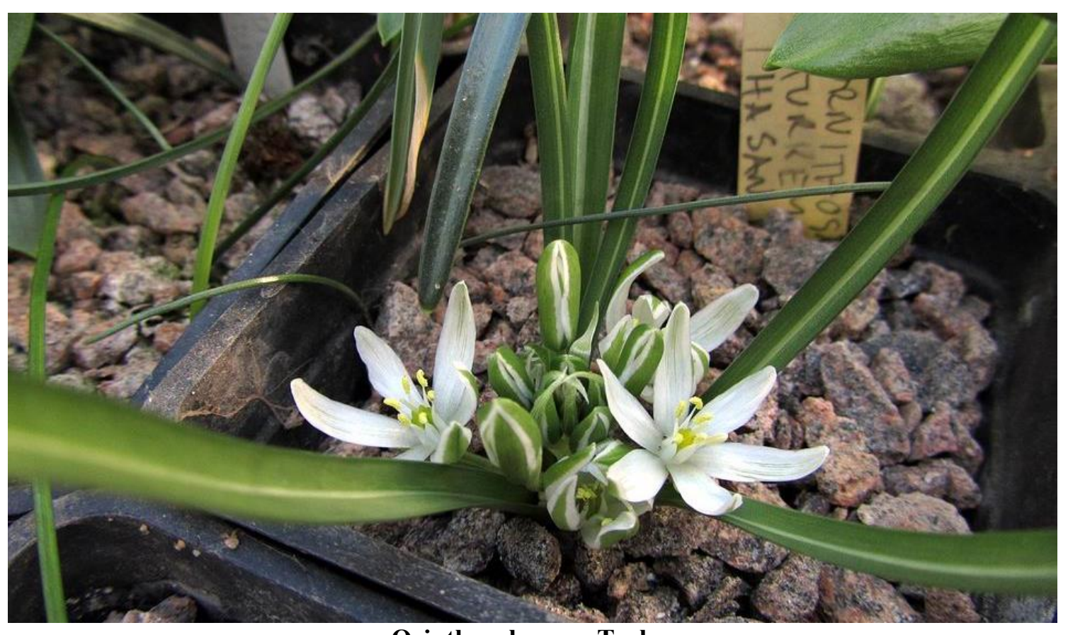
Orinthogalum sp. Turkey While superficially similar to the previous species note the very different leaves.