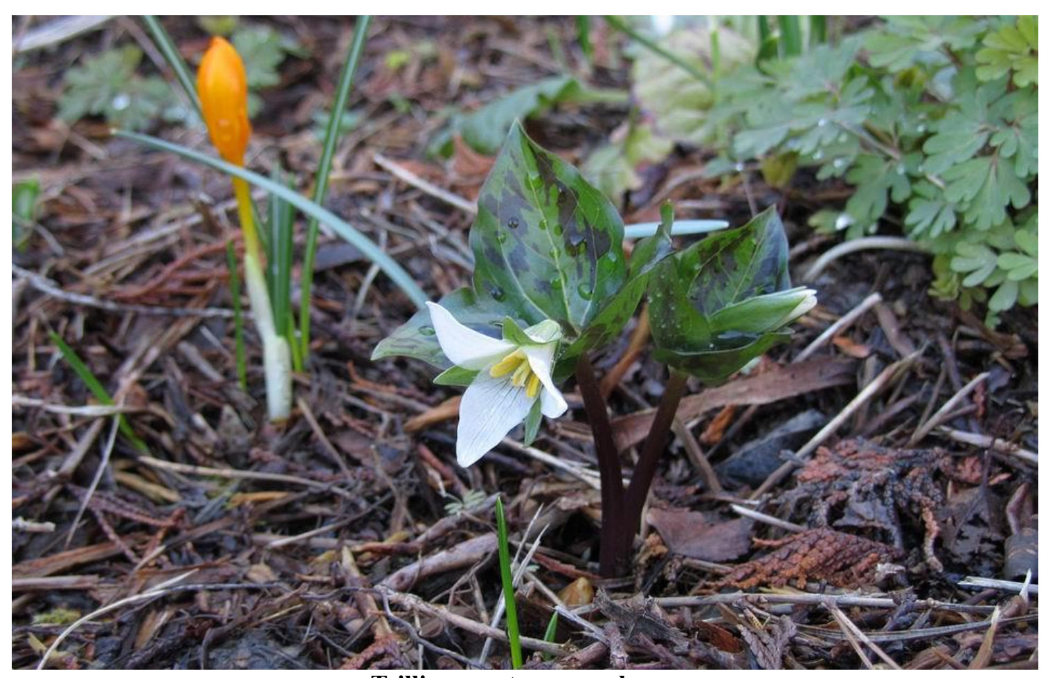
Trillium ovatum maculosum