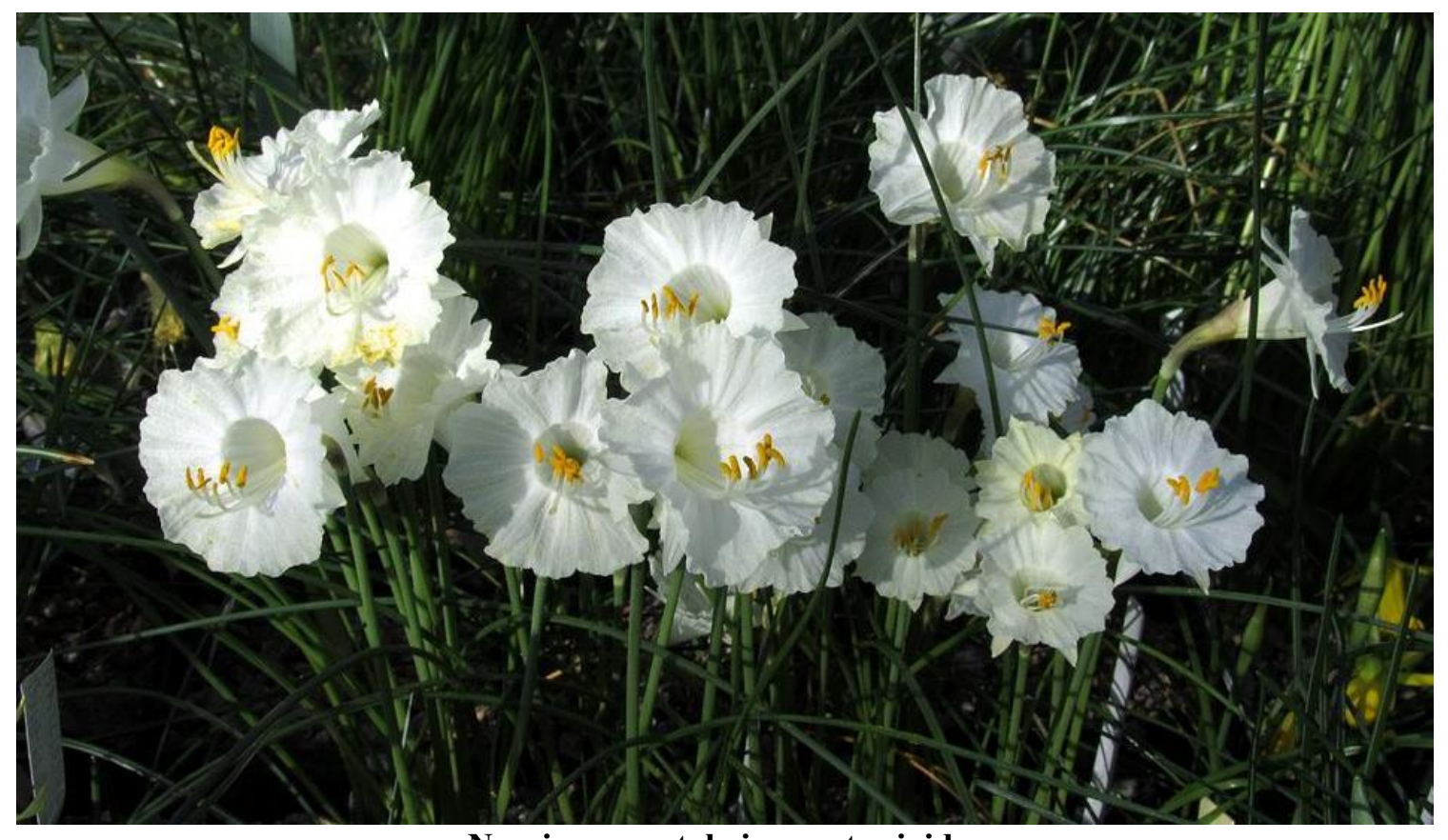
Narcissus cantabricus petunioides The pots of Narcissus cantabricus petunioides that I first showed a few weeks ago is now in full flower.