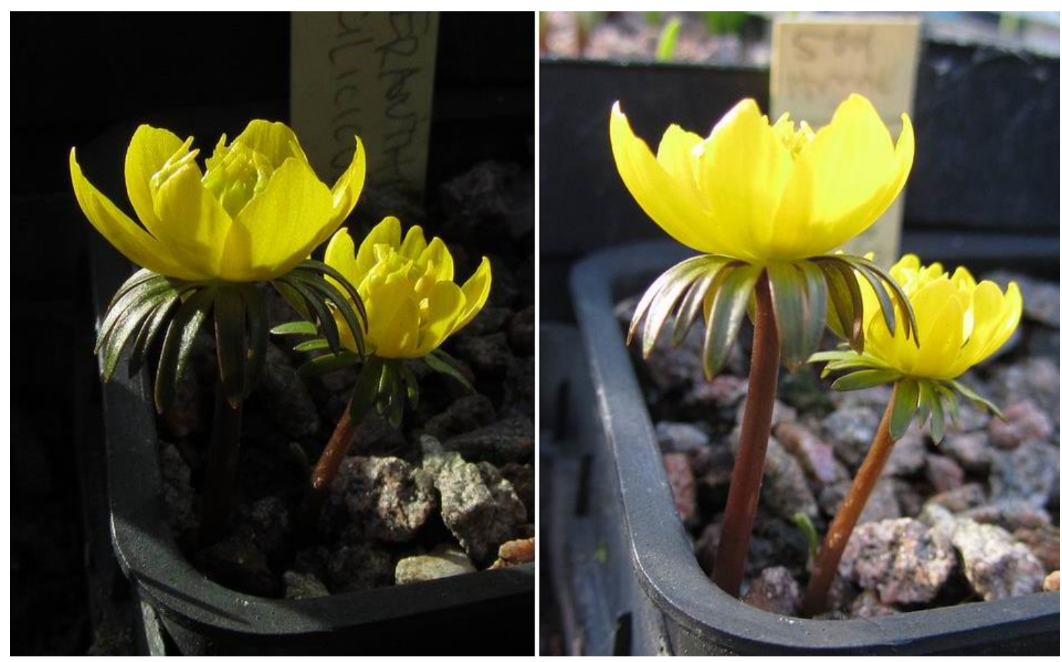
Eranthis x tubergenia This year I have the very first flowers on one of the seedlings – I will grow it on in a pot for a few years to try and build up a small stock before I try one in a garden bed.