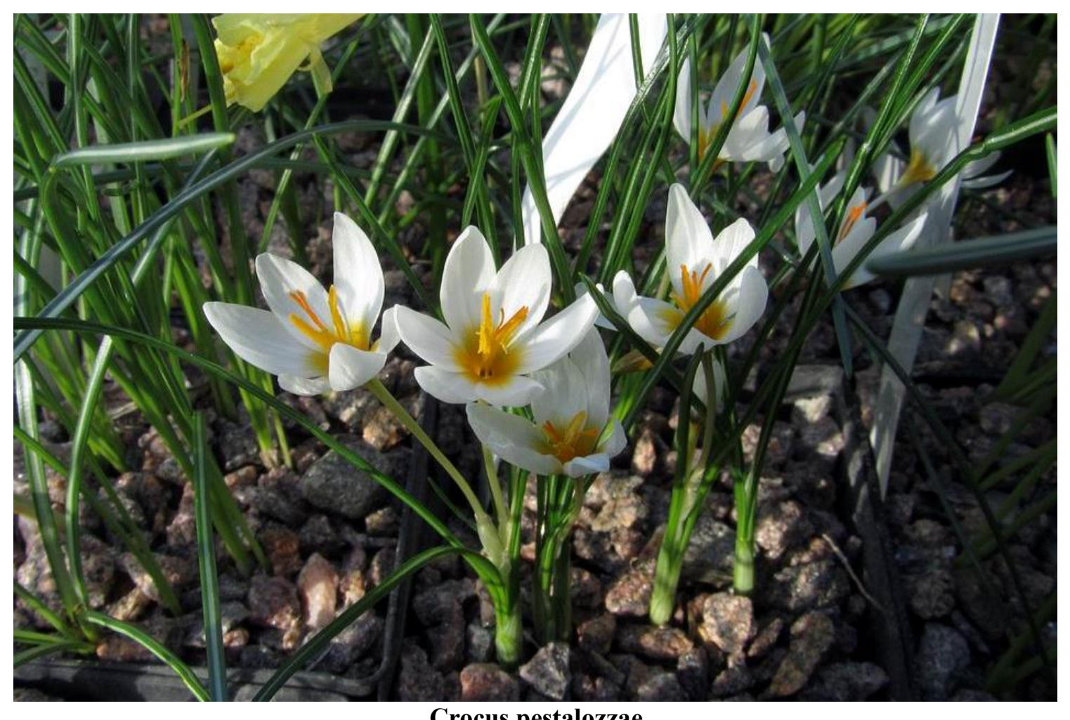
Crocus pestalozzae One of the smaller species that is thought to be one of the parents of Crocus x jessoppiae shown below.