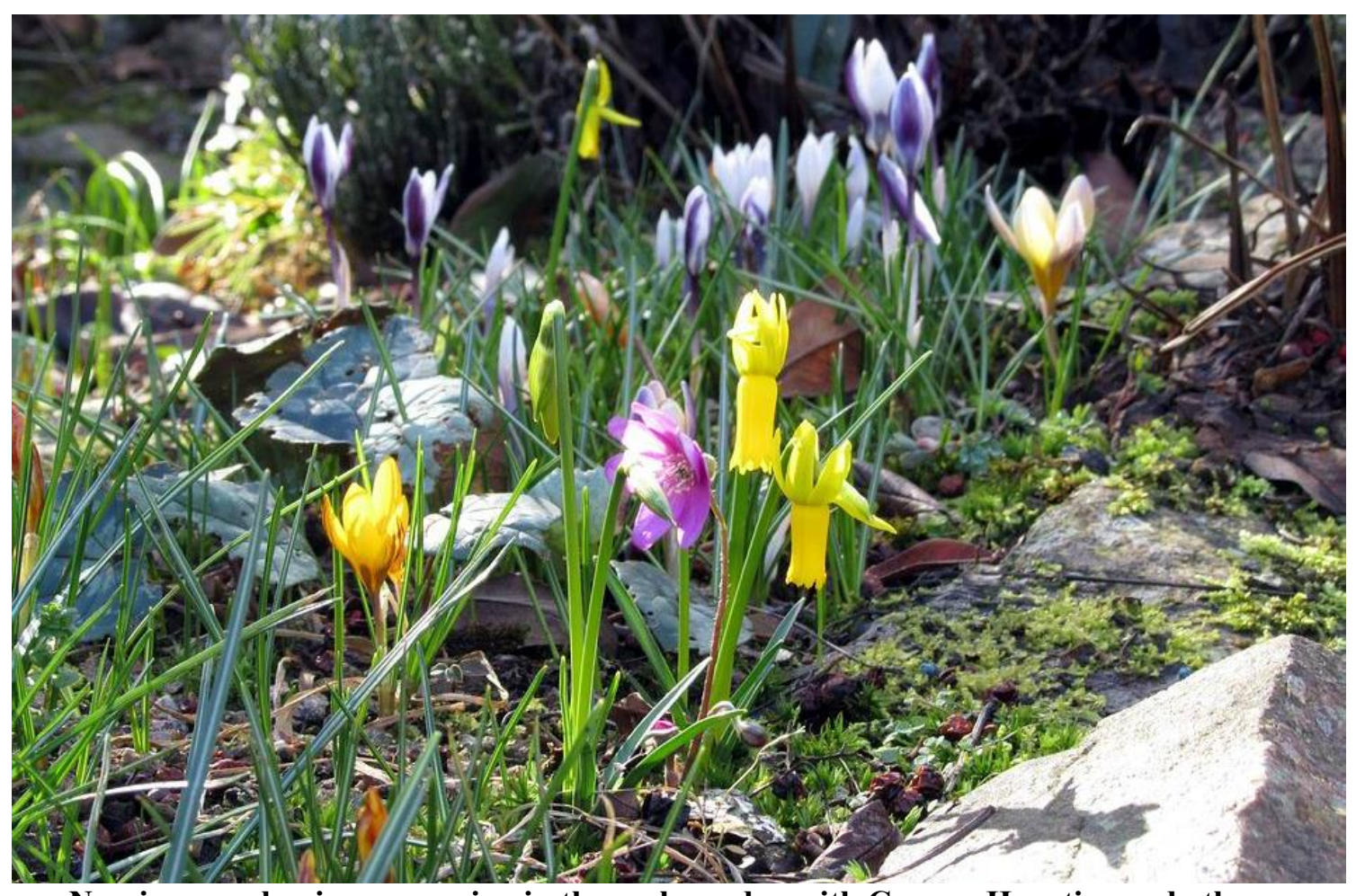
Narcissus cyclamineus growing in the rock garden with Crocus, Hepatica and others.